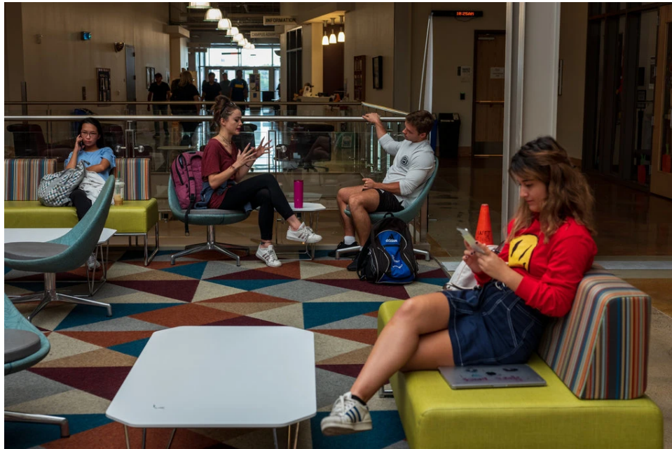
Students at Austin Community College. Texas’ voter ID law excludes college and university ID cards and out-of-state driver’s licenses that many students commonly carry.

Austin Community College, whose 39,000 full-time and 33,000 part-time students sprawl over campuses in four Texas counties, pursues a similar strategy. The system’s student body is drawn largely from working-class and minority families.