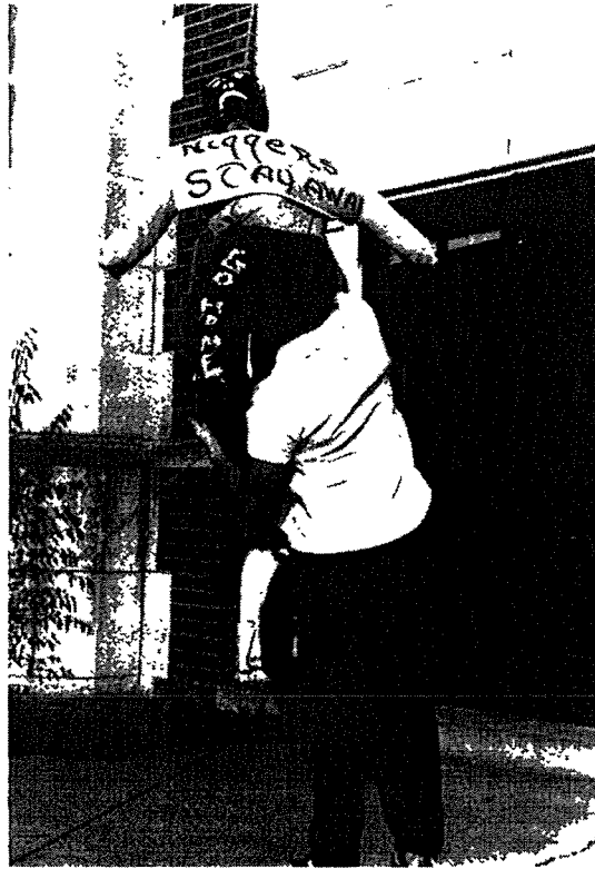
White students protest the Brown decision, which destroyed racial liberalism among southern whites and fomented massive resistance.

nects Brown , in an indirect and indeed almost perverse manner , with the landmark civil rights legislation of the mid-1960s. Finally, whether the Brown decision was a profound or a minor inspiration for the civil rights movement, the backlash thesis has explanatory power , since the critical federal legislative intervention occurred only after the civil rights movement intersected, at places like Birmingham and Selma, with the southern racial backlash . 3