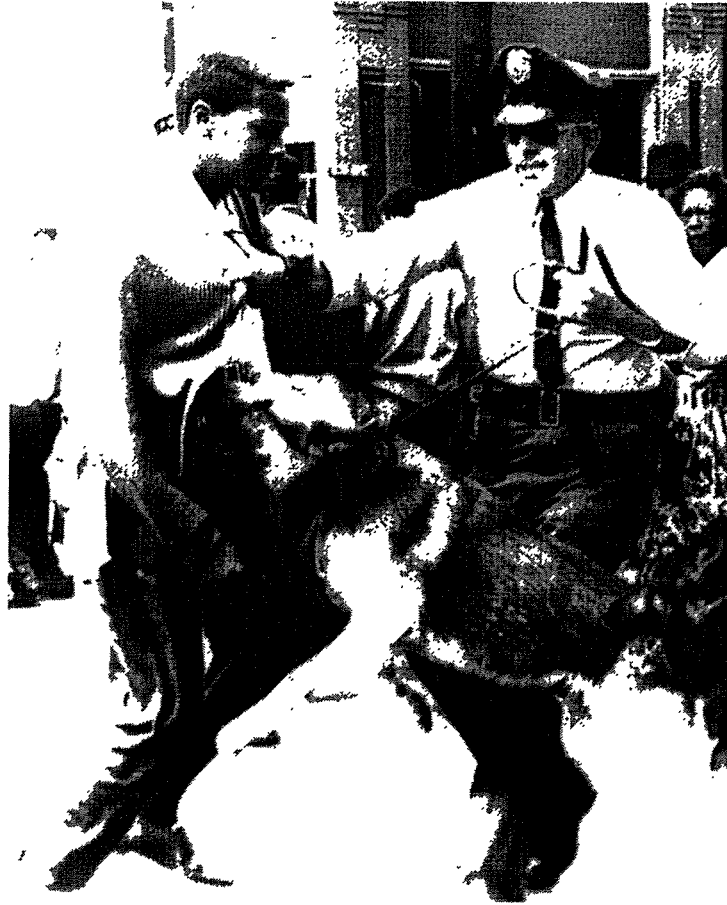
A black civil rights demonstrator is attacked by a police dog during the Birmingham, Alabama, confrontation of April and May 1963. President John F. Kennedy said this photograph made him "sick."