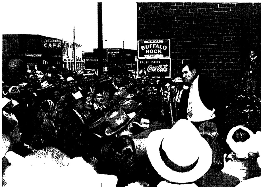
Big Jim Folsom, whose populist brand of racially moderate politics was shattered by the Brown decision, campaigns in Warrior, Alabama, in the Democratic gubernatorial primary of 1954.

lower-class whites who had supported Jim Folsom's populism in the late 1940s and early 1950s tended to support George Wallace, who knew no equal when it came to exploiting the racial hysteria of the post- Brown era. 33